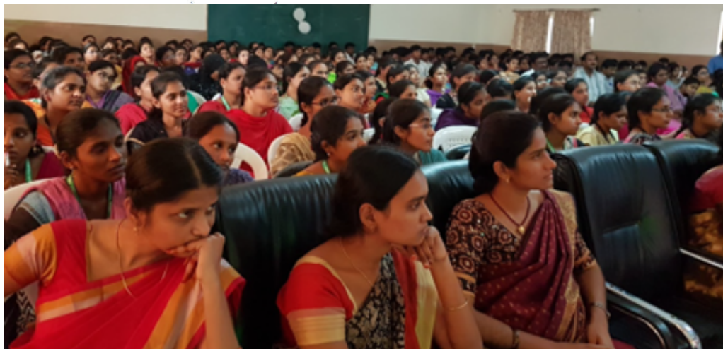
Glimpse of “Workshop on Medical Practice Management Software” held on 27-06-2017.