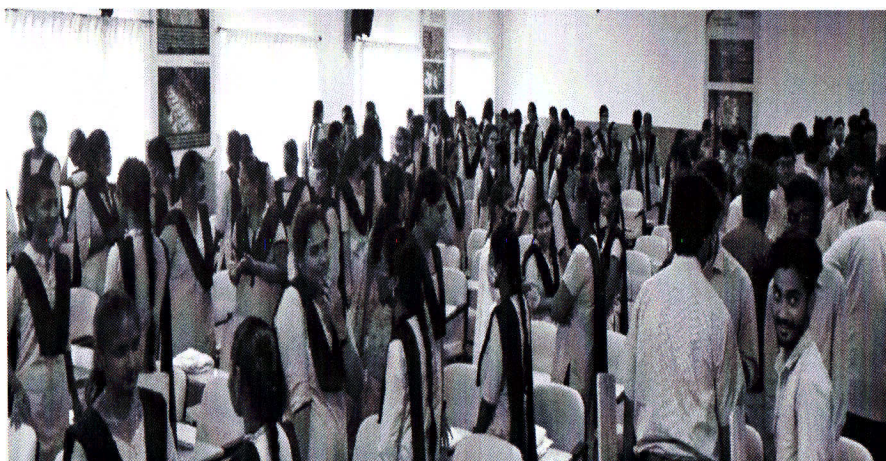
Glimpse of “If I were – Problem Solving Skills” held on 23-08-2017.