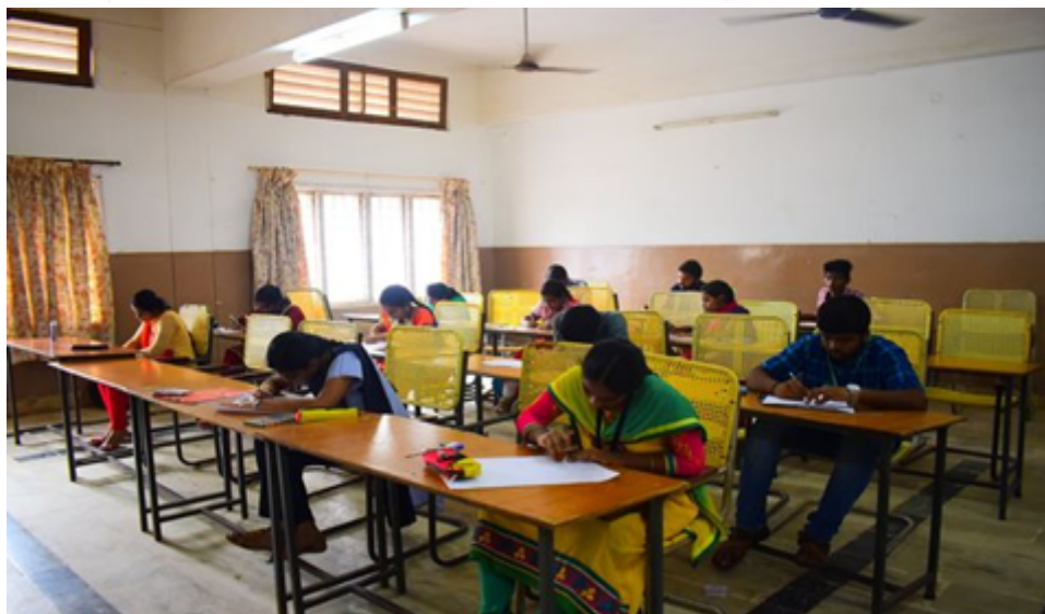
Glimpse of "Technical English Vs Interview" held on 10-04-2018.