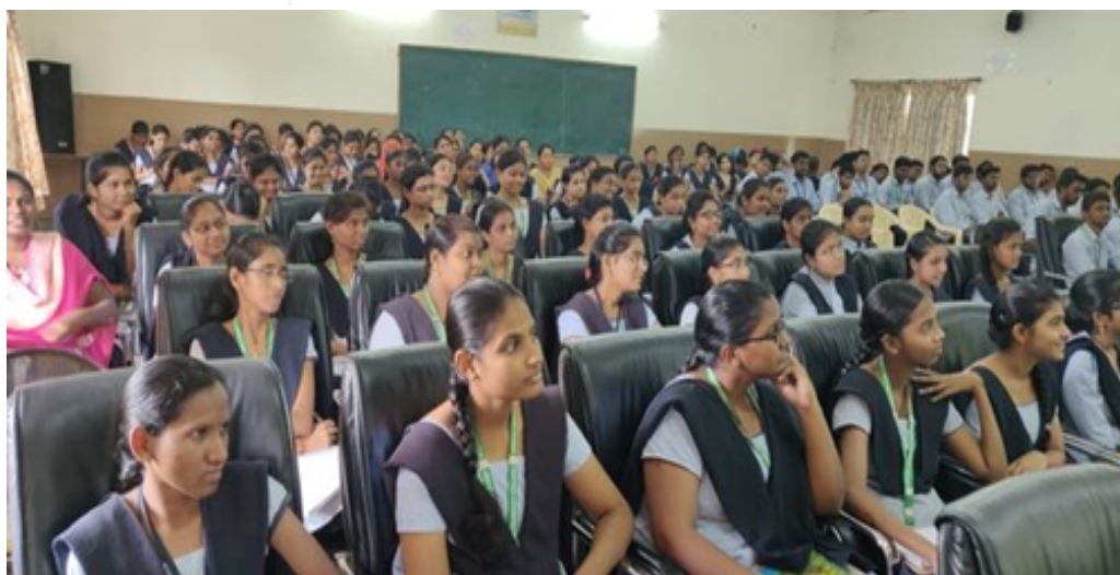
Glimpse of “Skit on Formal and Informal situation - Etiquettes” held on 05-07-2017.