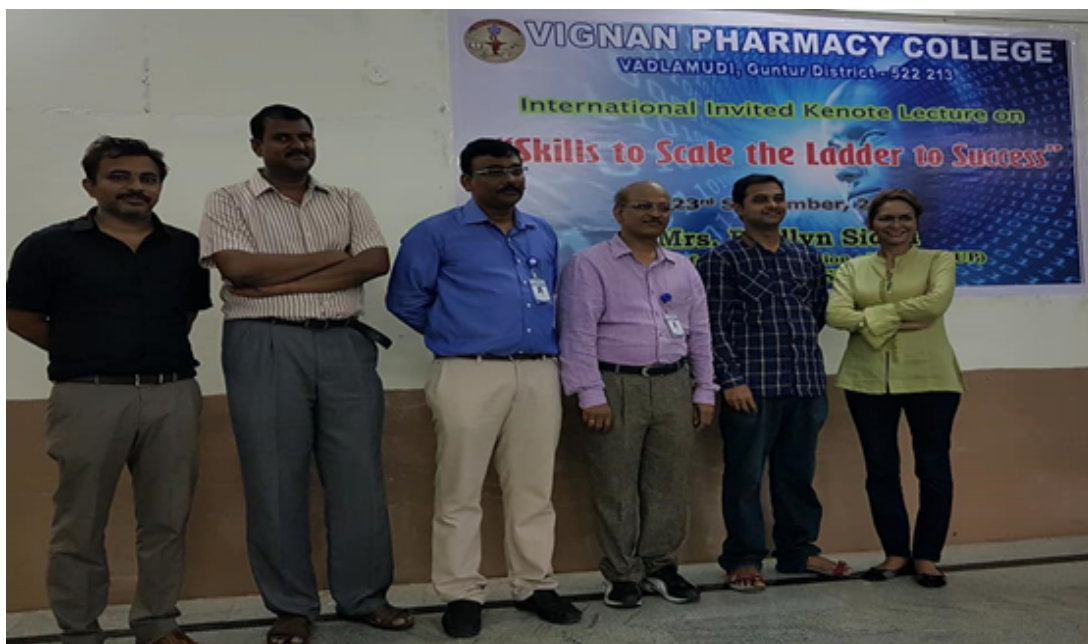
Glimpse of "Skills to Scale the Ladder to Success" held on 23-09-2017.