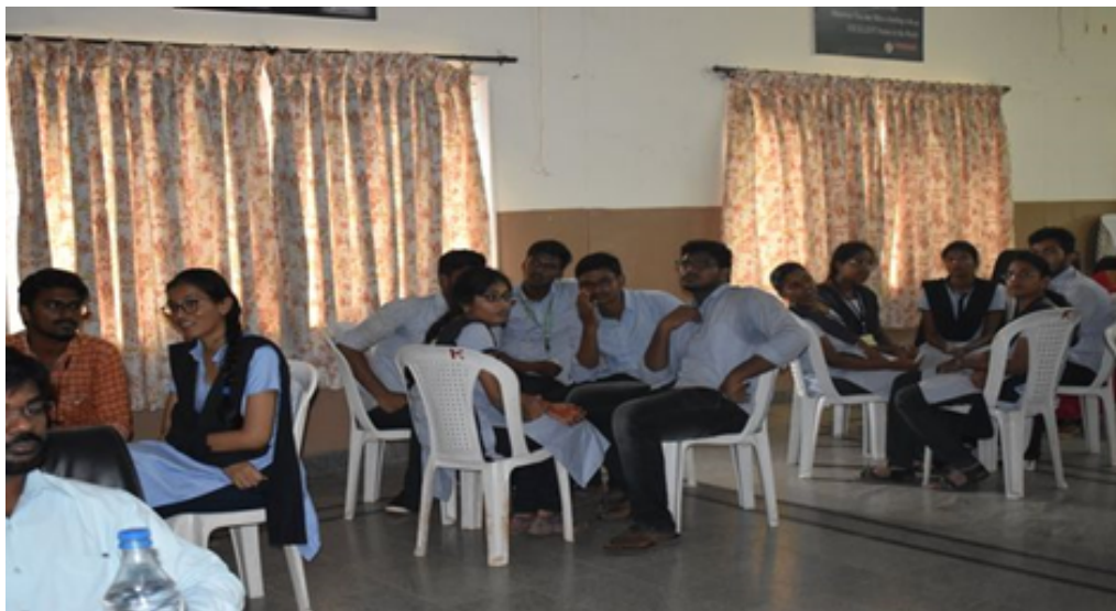
Glimpse of "Q & A Session- Constructive Criticism" held on 17-07-2017.