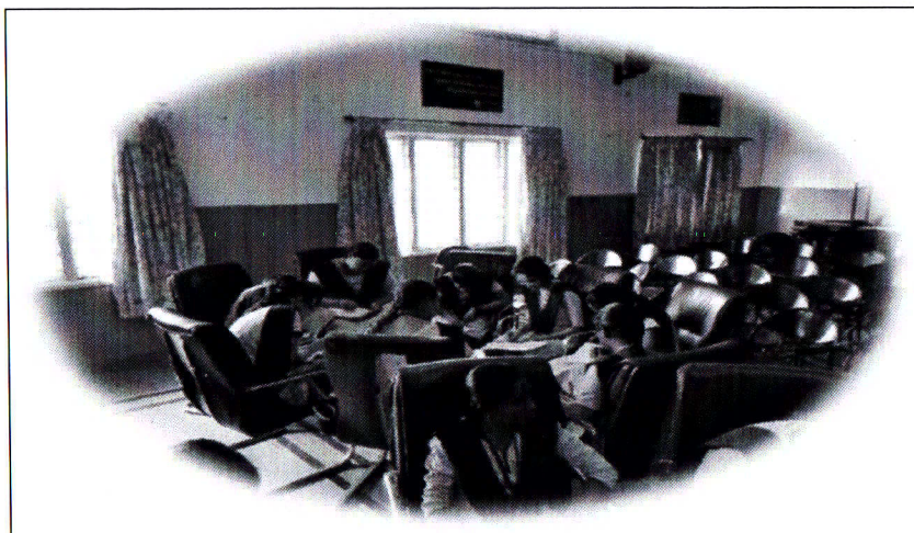
Glimpse of "Fostering Ethical Learning Environment through Carrier Attributes" held on 13-11-2017.