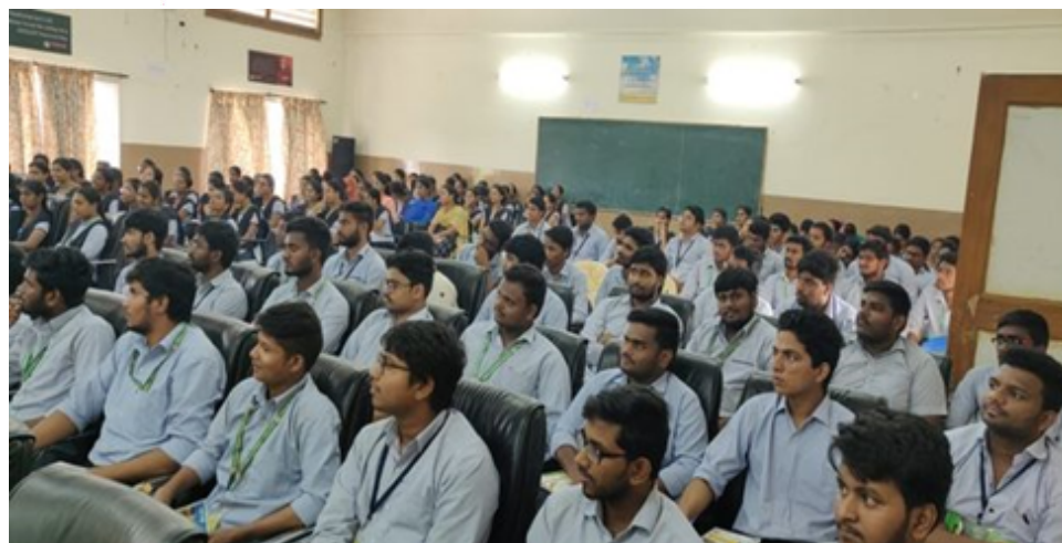
Glimpse of “Animal Simulation: An Effective Learning Resource” held on 05-08-2017.