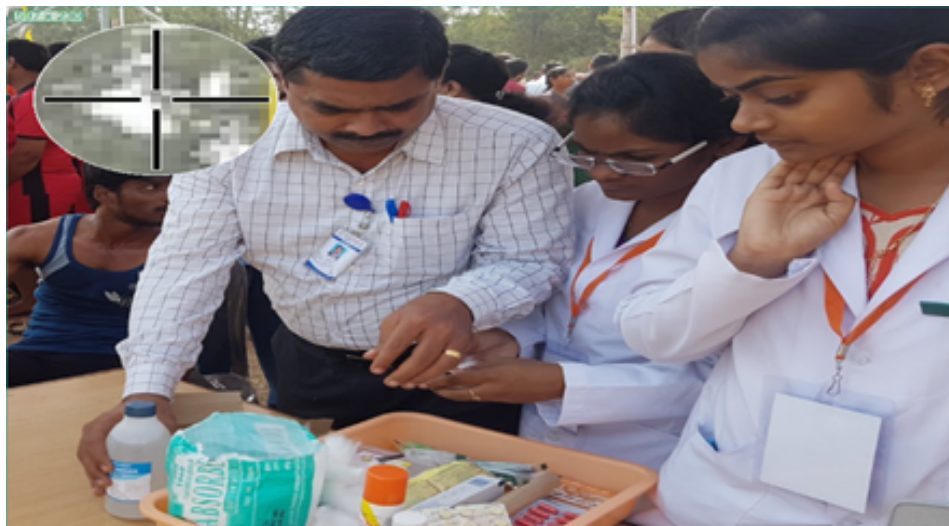
Glimpse of “First Aid: The Training Key to Save Lives” held on 08-07-2017.