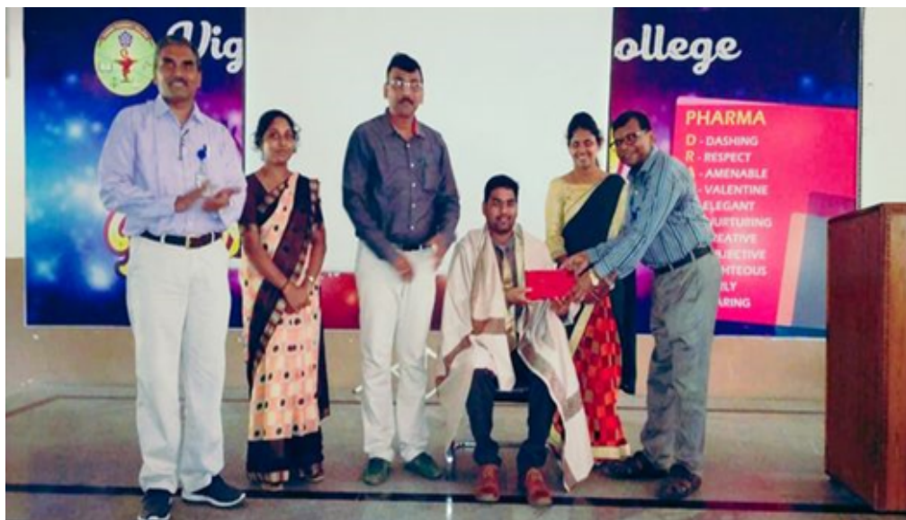
Glimpse of “Stress Management Session” held on 16-06-2017.