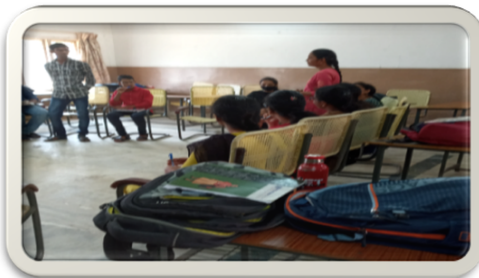
Glimpse of “Etiquettes – Mock Interview” held on 19-06-2017.