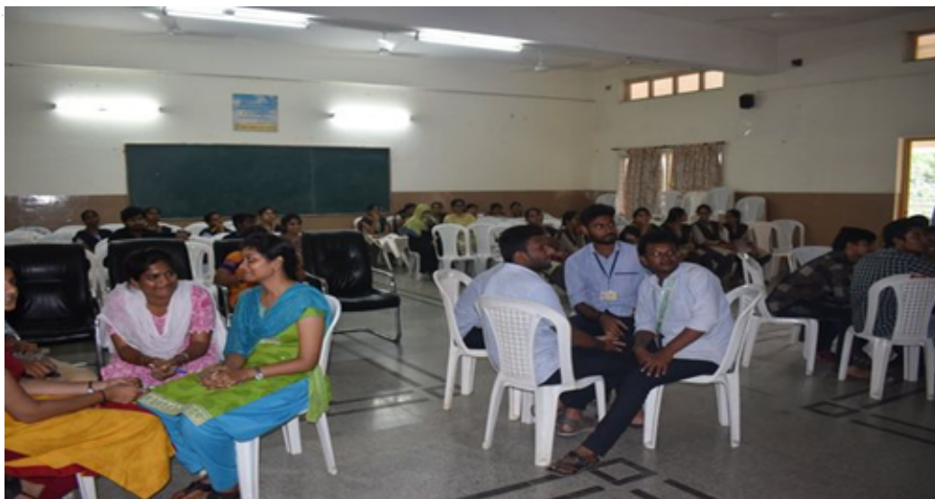
Glimpse of “Group Discussion for Balancing Friendliness with Firmness” held on 24-07-2017.