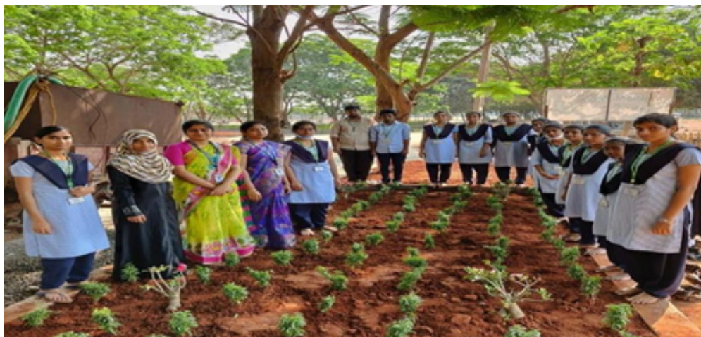
Glimpse of “Creating Awareness on Plantation of Trees” held on 16-05-2018.